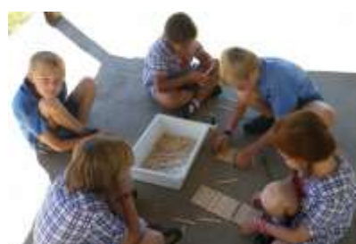
Hawks bridge building activities