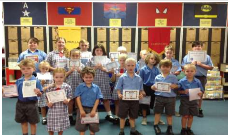
Congratulations to our students for their awards from Mondays assembly.

Congratulations are also extended to the following students who were awarded at our Assembly on Monday morning: