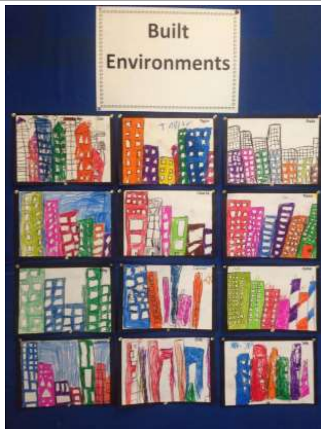
Rosellas' built environment art.

In eighteenth century London, two children, Elizabeth and Tom, are so hungry, they steal a loaf of bread from the bakery. They are caught and transported to Australia aboard a convict ship. Their time on board is harrowing and the voyage is certainly not smooth sailing. By the time they arrive in New South Wales, Tom is ill with fever and his fate unknown.