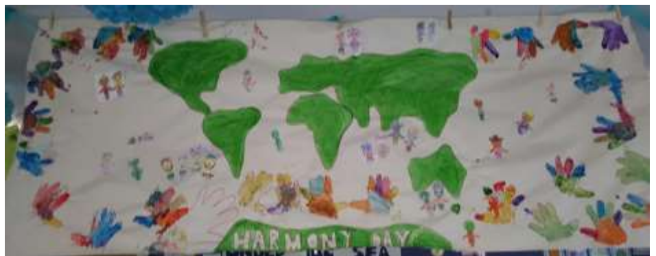
Budgies making a world of difference ☺