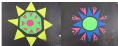
Hawkes mosaic art.