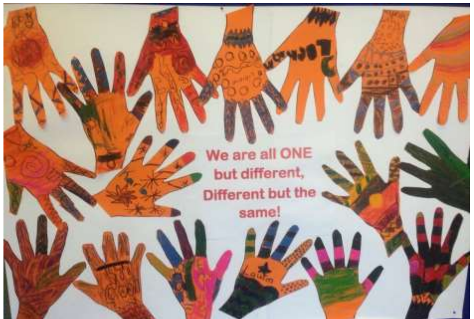
Rosellas' "hands on" Harmony Day